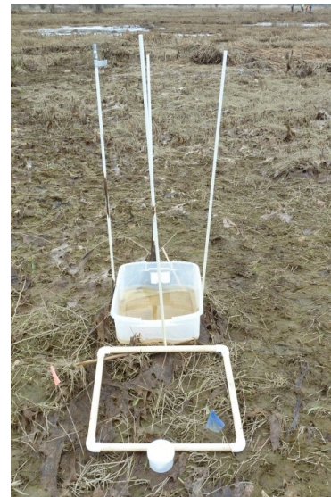
Figure 2. Vegetation quadrat placed next to fall-out trap, Nisqually, WA.