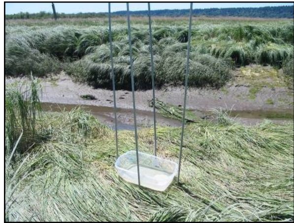
Figure 1. Fall-out trap, Nisqually, WA.

To assess capacity of the restoration to produce prey resources for juvenile Chinook salmon, we will sample insects that fall into the water from the aerial environment using fall out traps. This sampling is paired with fyke net surveys for juvenile Chinook. These traps measure the direct input of invertebrates from the marsh to the aquatic system by capturing insects that fall or settle onto the surface of the water (Gray et al 2002). Three replicate traps will be deployed monthly between March and August (outmigration season) at each intensive fish sampling site during the low tide and allowed to float with the tide. The traps will be left to sample for 48 hours over an entire tidal cycle.