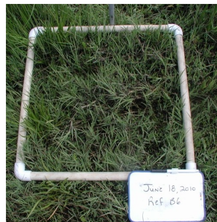
Figure 3. Photo of vegetation quadrat.