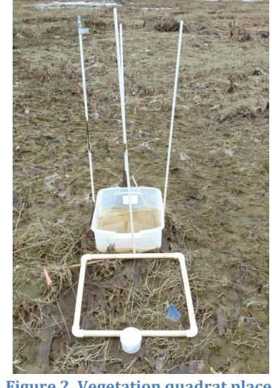
Figure 2. Vegetation quadrat placed next to fall-out trap, Nisqually, WA.