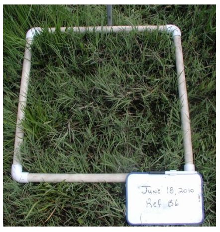
Figure 3. Photo of vegetation quadrat.